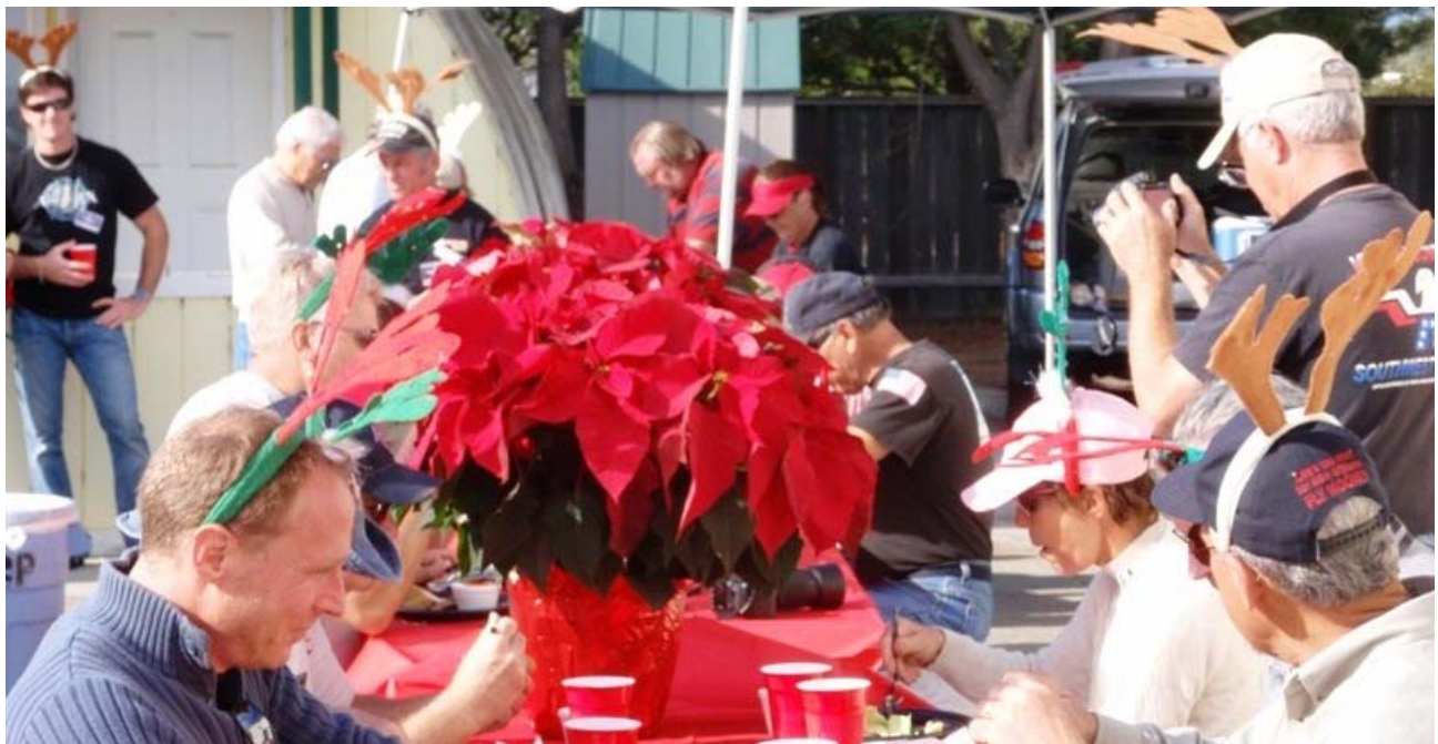
Fun, food, antlers, and color