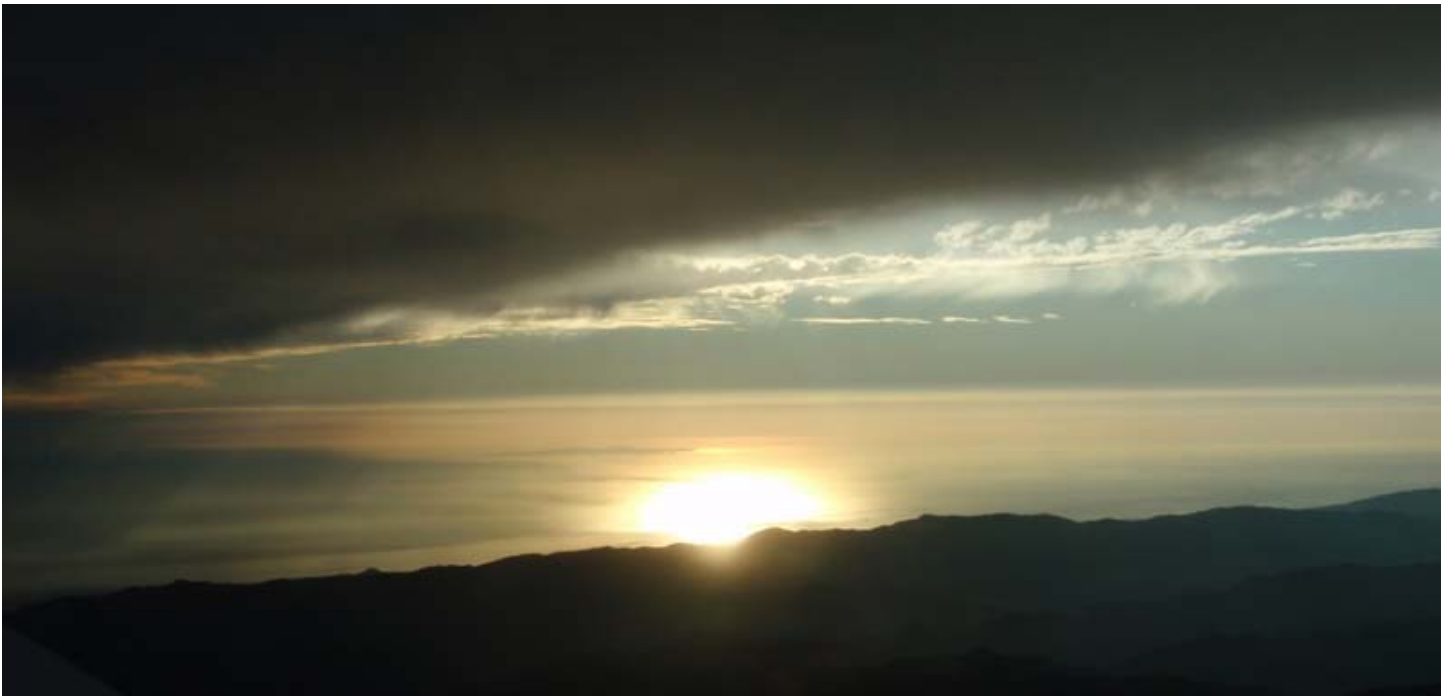
The hidden sun's reflection, a striking picture, only visible from up here