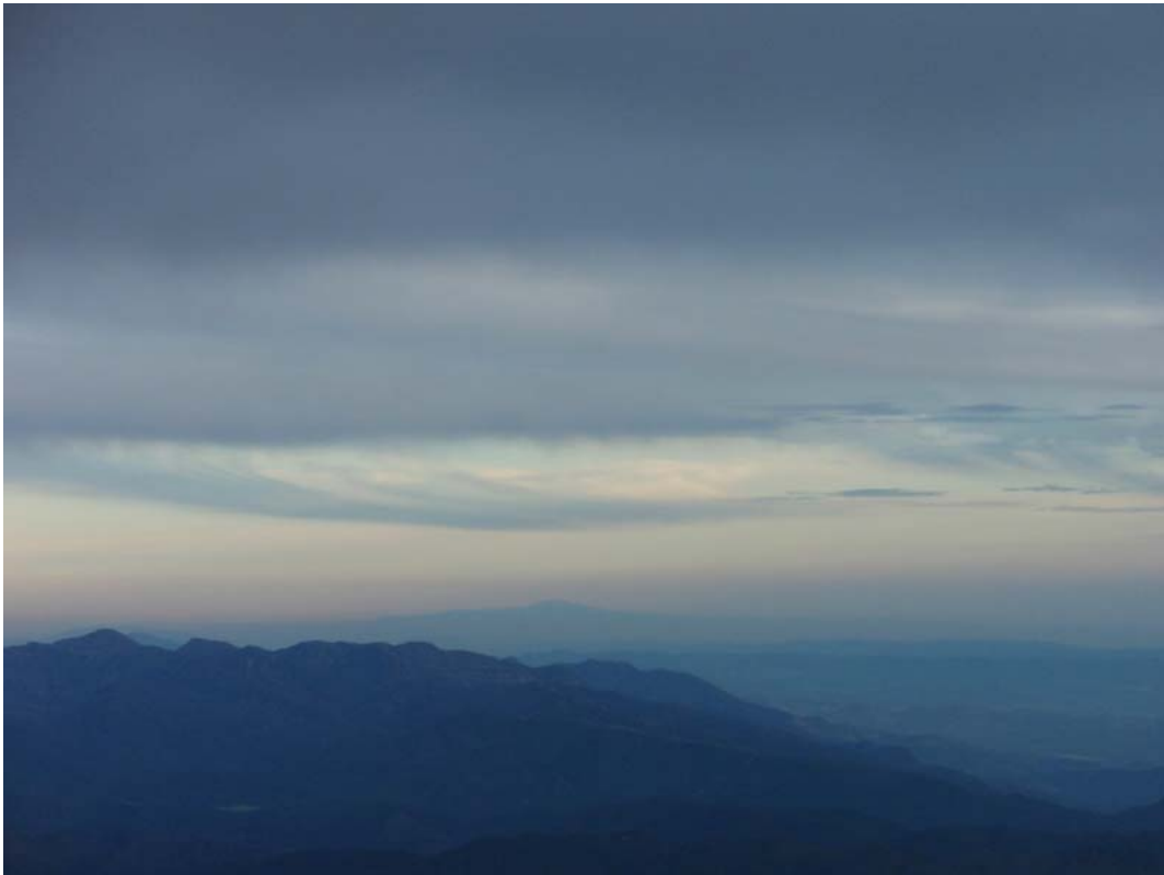
Yes, a very different look enroute back with lower clouds but a clear path The mild peak in the distance is the Santa Ana Mountains 100 miles away