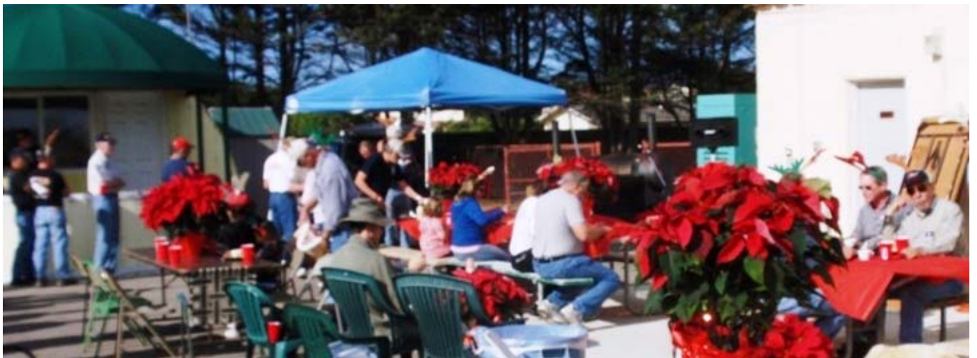
Lunch line and lunchtime - the chef served food was superb!