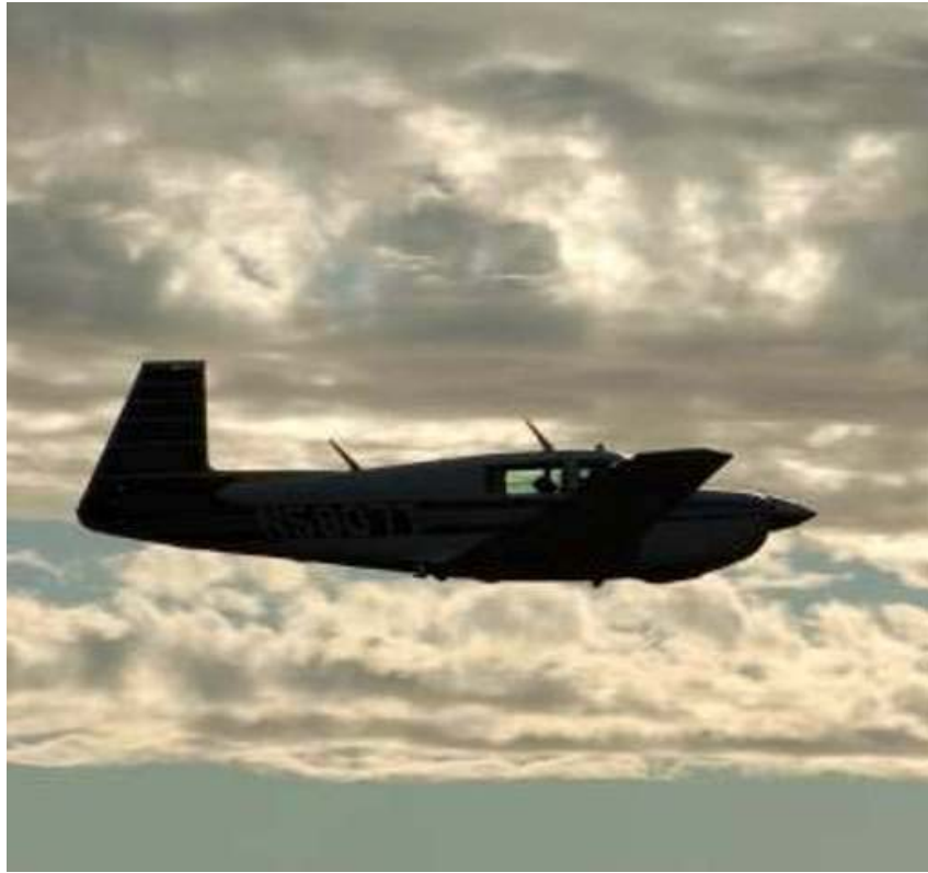
I did a low pass over the runway - ZOOM