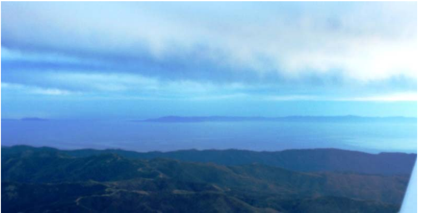
The Channel Islands