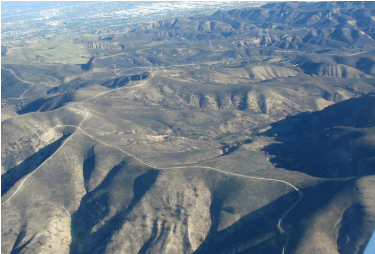
Miles of burned devastation were below us