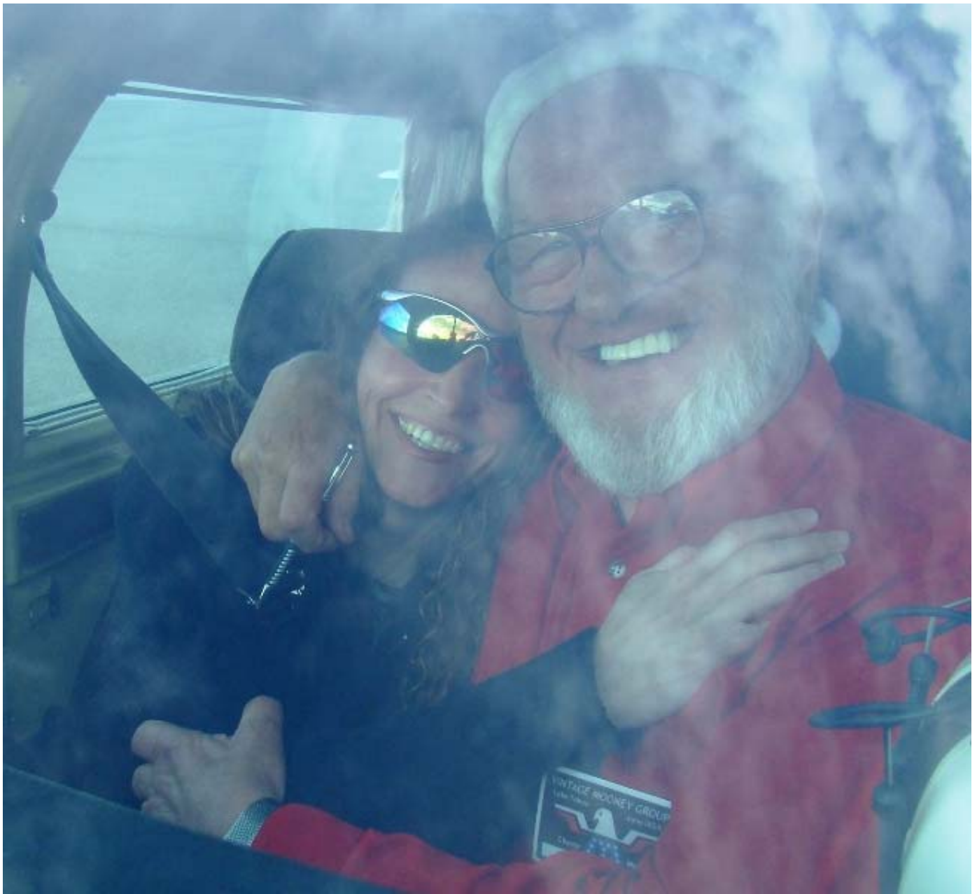
Getting ready to go ourselves, and hamming' it up for the camera - really