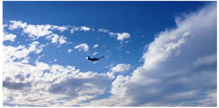
The sky changed while we were lovin' life below - then a Mooney departed for home