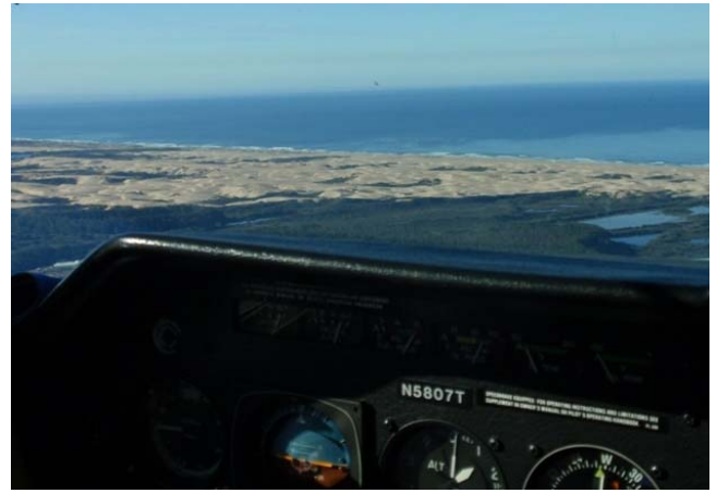
An hour later, we were getting close and closer