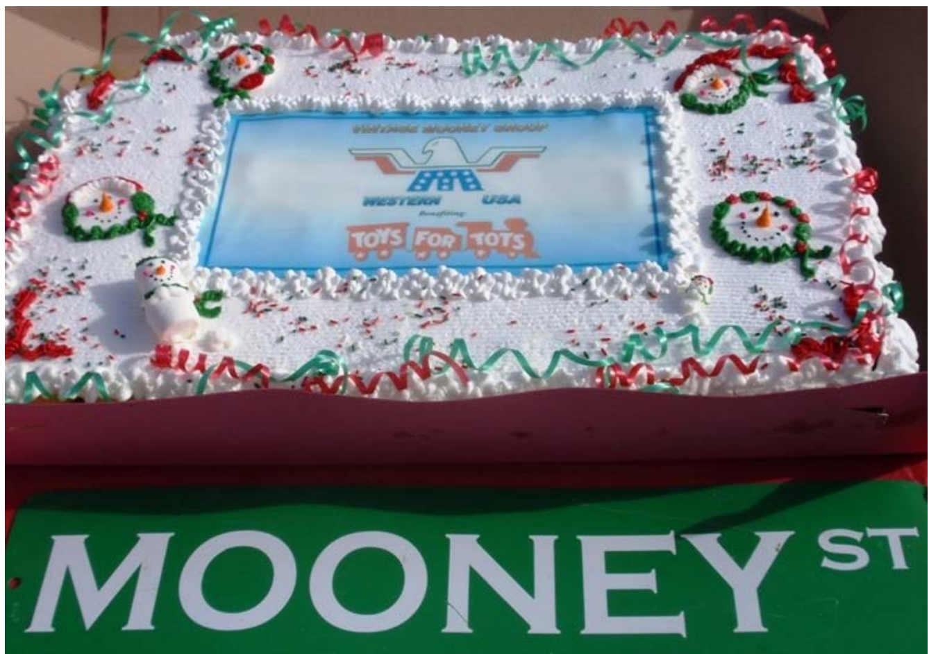
Talk about a professional job, it was all cupcakes below that perfect bed of frosting