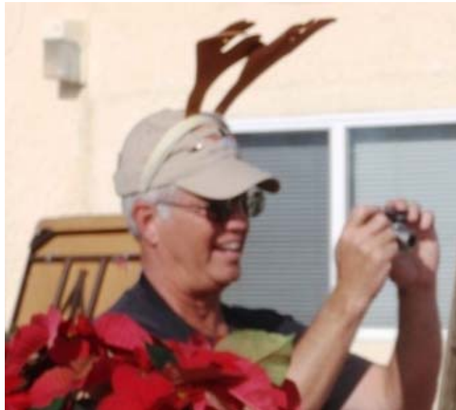
Candid picture of our picture taker